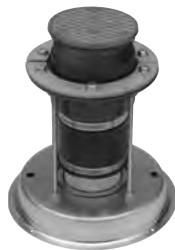
Ⓢ Shown with -SA Stabilizer Option